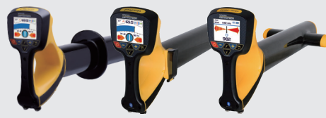
vLoc2 receiver series